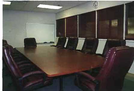
Comfortable, upholstered chairs around a large table allow for plenty of space for your next business meeting in our conference room .