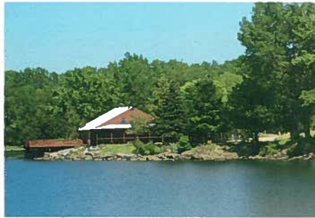
A serene retreat in the city, Tift Nature Preserve is located just three miles from downtown Buffalo off the new Outer Harbor Parkway. A large room and amenities are available indoors. However, the 264-acres containing five miles of trails, three boardwalks and cattail marsh are the real draw. Fishing at Lake Kirsty, snowshoe rentals and expert guides are also available.