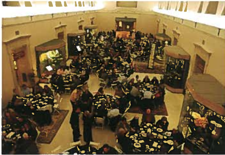
Hamlin Hall , an elegant hall in the heart of the Museum, is the perfect area for formal events, from sit-down dinners to lively receptions.