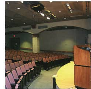
Our auditorium provides a special venue for your concert, theatrical production or presentation.