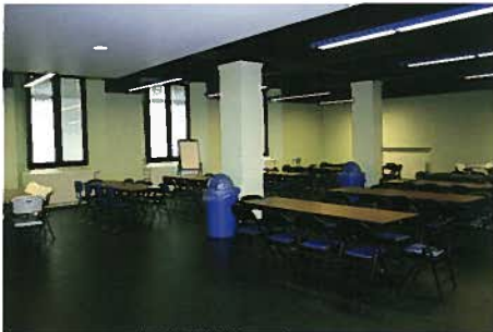
The Cummings Room features flexible set-up for everything from workshops and training sessions to sit-down dinners and banquets.