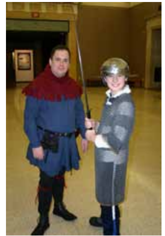
Dagorhir Battle Games will help guests get in touch with their medieval side.