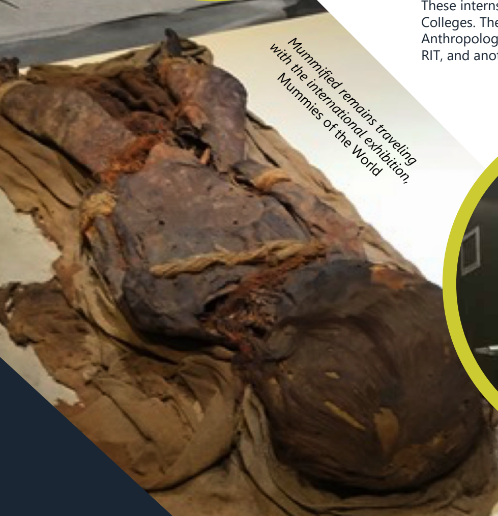
Mummified remains traveling with the international exhibition, Mummies of the World