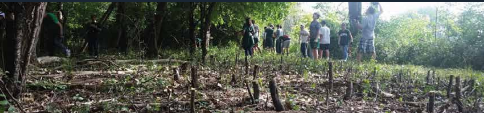
Above: Buckthorn that has been removed as a part of the Vernal Pools Enhancement Project.

Tifft was also fortunate to receive major funding from the Buffalo and Erie County Greenway fund to continue the renovation and improvements of the Herb and Jane Darling Environmental Education Center.