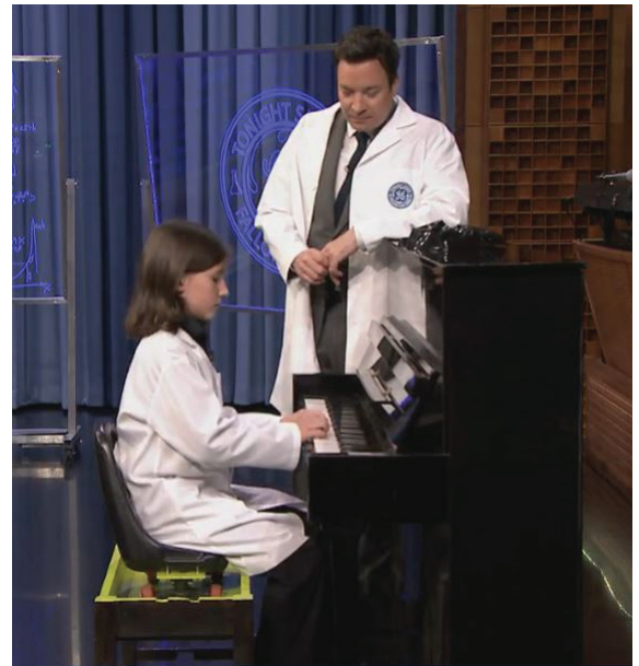
WNY Inventor on the Tonight Show,

Help our Western New York students experience the thrill of personal innovation, empower them with creative problem-solving skills, and showcase their remarkable results at our annual event!