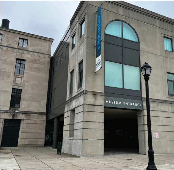
Buffalo Museum of Science 1020 Humboldt Parkway Buffalo, NY 14211-1208